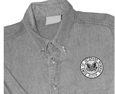
703 LS Long-sleeve Denim 702 SS Short-sleeve Denim