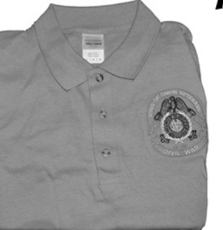
750 SUV Polo Shirt Royal blue or Red

SUVCW Charitable Foundation Wisconsin Lo. 5297 Special until next Banner