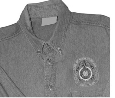
752SS Short-sleeve Denim 753LS Long-sleeve Denim