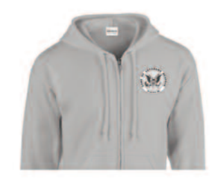
#713 SVR Hoodie Carolina blue $45.00 + shipping