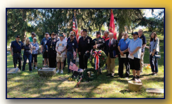
Tour group at Greenwood Cemetery