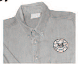
703 LS Long-sleeve Denim 702 SS Short-sleeve Denim