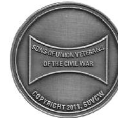
Son's Coins WAS $12.50 NOW $3.00 Per