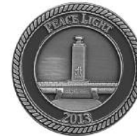
Gettysburg 2013 NOW $3.00 Per

Camp Flags at Lower Prices 3x5 was $350.00 - Now $320.00 3x5 with Fringe was $400.00 - Now $345.00 4x6 was $425.00 - Now $350.00 4x6 with Fringe was $475.00 - Now $380.00 Add $20.00 Postage for EACH flag,