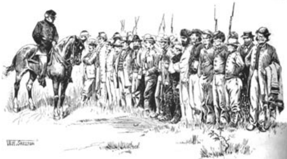
Captured Confederate troops, from a contemporary sketch