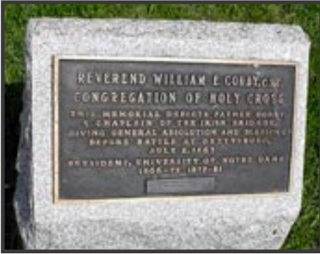
Plaque commemorating Father Corby at Gettysburg

I would like to invite all SUVCW members in the Department of Indiana to