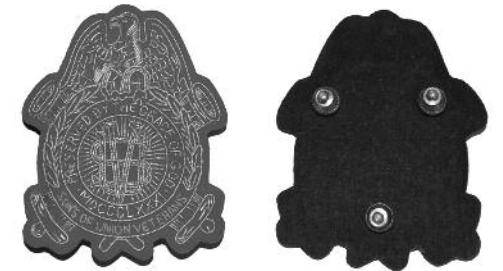
#781 Jacket Patch Removable from jacket to jacket or shirt $28.00 each

SUVCW Pens – Great handouts with email address Dozen-$5.00