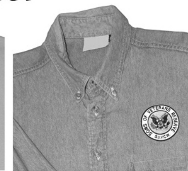
703 LS Long-sleeve Denim 702 SS Short-sleeve Denim