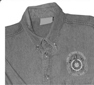
752SS Short-sleeve Denim 753LS Long-sleeve Denim