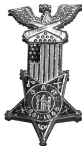
#729 GAR Lapel Pin $15.00 each

CHECK OUT OUR WEBSITE AT SUVCW.ORG FOR ALL MERCHANDISE