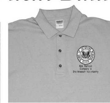
700 SVR Polo Shirt Kersey blue only