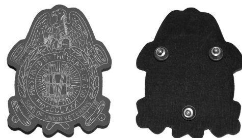
#781 Jacket Patch Removable from jacket to jacket or shirt $28.00 each

#613 DUVCW Challenge Coins was $5.00 – now $3.00 until gone