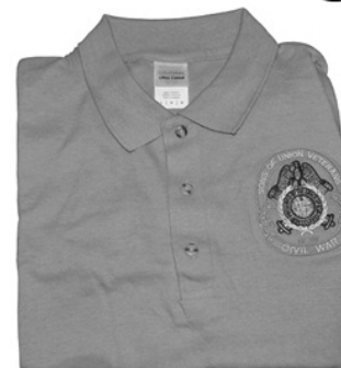
750 SUV Polo Shirt Royal blue or Red