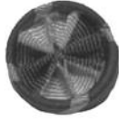
Membership Rosette #351