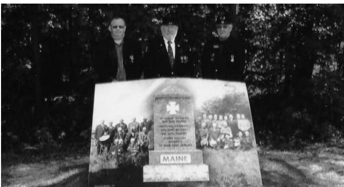
The missing part of the ceremony was the actual monument, which had been delayed because of Covid.

The Maine monument was finally delivered mid November and installed.