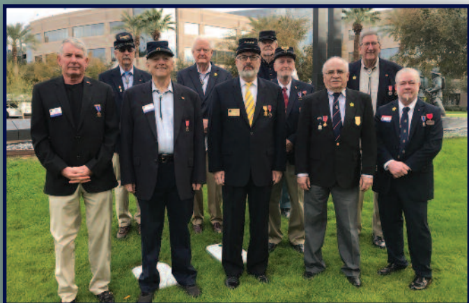
Department of the Southwest