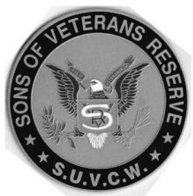
#115 SVR Auto Badge full color, adhesive backed for the grill, rear window or back of car $20.00 + shipping