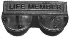
Life Member #350