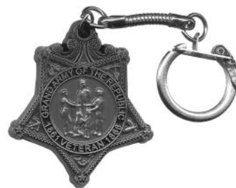
#157 GAR keychain $10.00 + shipping