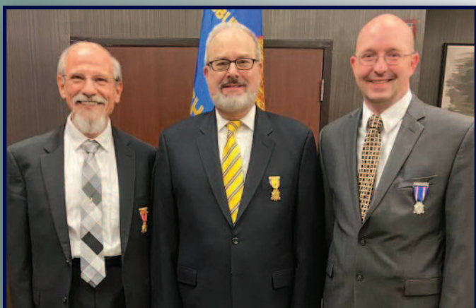
Three current Commanders from the Irish Brigade Camp - Department of the Chesapeake