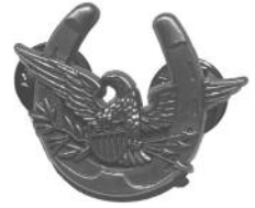
Horseshoe Lapel Pin #803