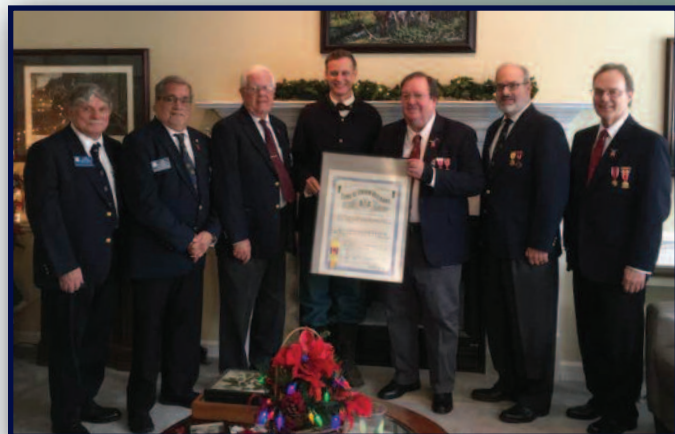
Maj. General Judson Kilpatrick Camp 7 of the Department of North Carolina