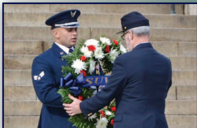
President Lincoln's birthday at the Lincoln Memorial in Washington, DC