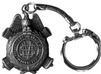
#154 SUVCW keychain $5.00 + shipping