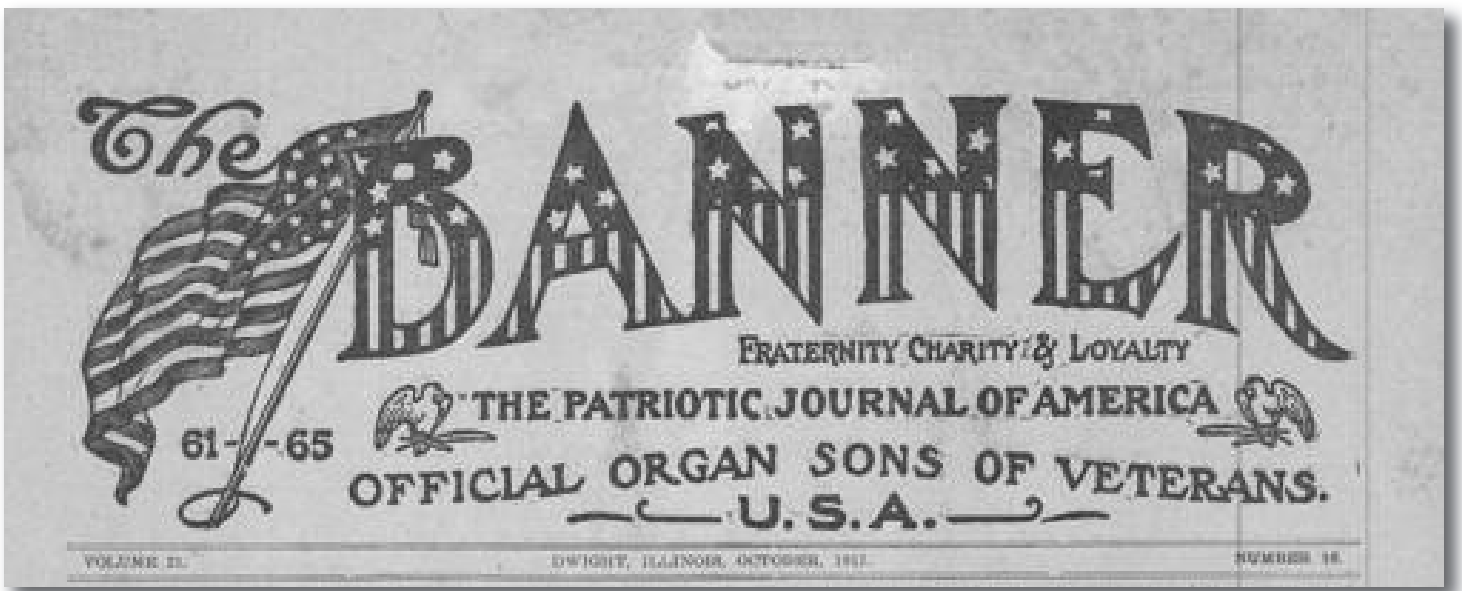
1917 Cover of The Banner

Should your Camp or department want additional details on Garfield Camp’s program, please feel free to contact CC Brian Horgan via email: bhorganpa@aol.com