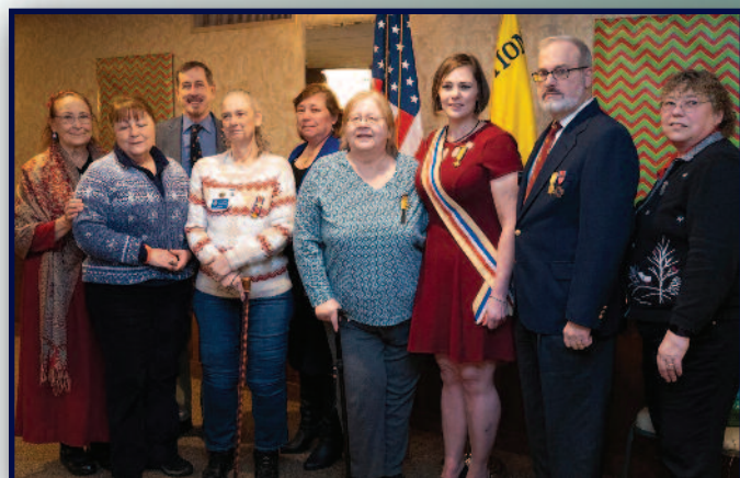
Wisconsin SUVCW and Auxiliary annual Christmas luncheon