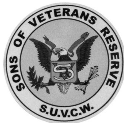
#326 SVR Window Decal 4 " reflective $5.00 + shipping