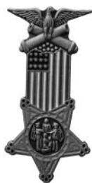
#107 GAR lapel pin $5.00 + shipping