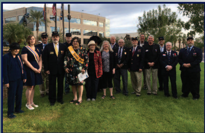
Pearl Harbor Remembrance Day in Phoenix, AZ