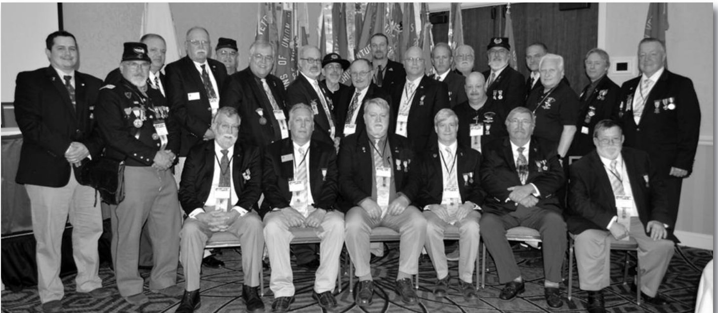
National Officers 2022 - 2023