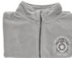
#754 SUVCW Royal Blue Fleece Vest $50.00 + shipping