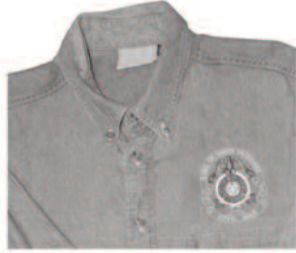
752SS Short-sleeve Denim 753LS Long-sleeve Denim