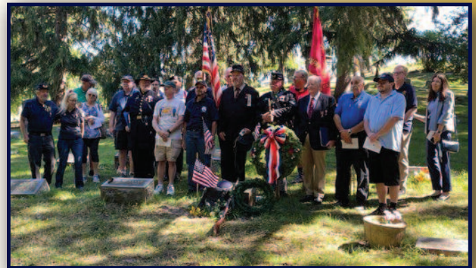
Tour group at Greenwood Cemetery