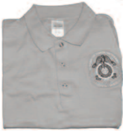
750 SUV Polo Shirt Royal blue or Red