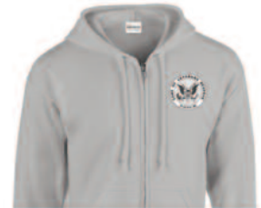
#713 SVR Hoodie Carolina blue $45.00 + shipping