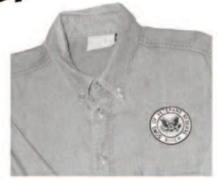
703 LS Long-sleeve Denim 702 SS Short-sleeve Denim