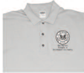
700 SVR Polo Shirt Carolina blue only