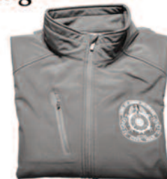
#755 soft-shell jacket navy blue fitted w/micro fleece lining, embroidered logo $95.00 + shipping