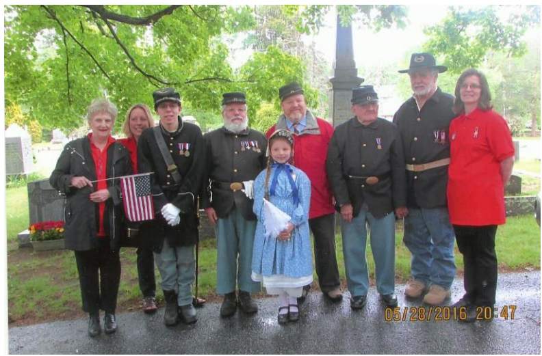
The Department received a great boost in publicity when it featured in an article by in the Fall 2016 edition of SooNipi Magazine .